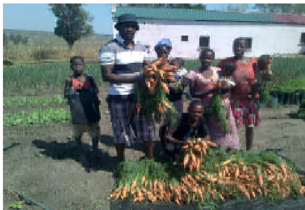
Harvest of carrots with volunteers

With the support of students and other volunteers, our garden is doing fine and we have been harvesting vegetables.