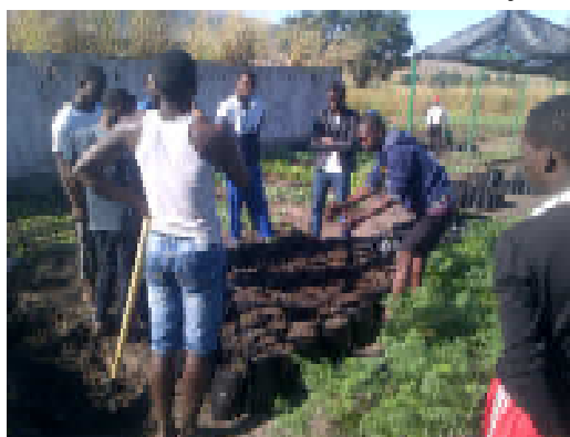
Students sowing fruit tree seeds in plastic bags