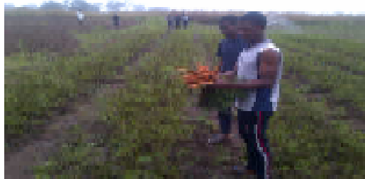
Students harvesting carrots