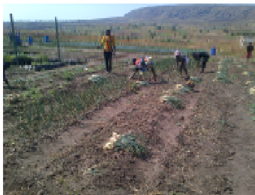
Onion harvest with the community